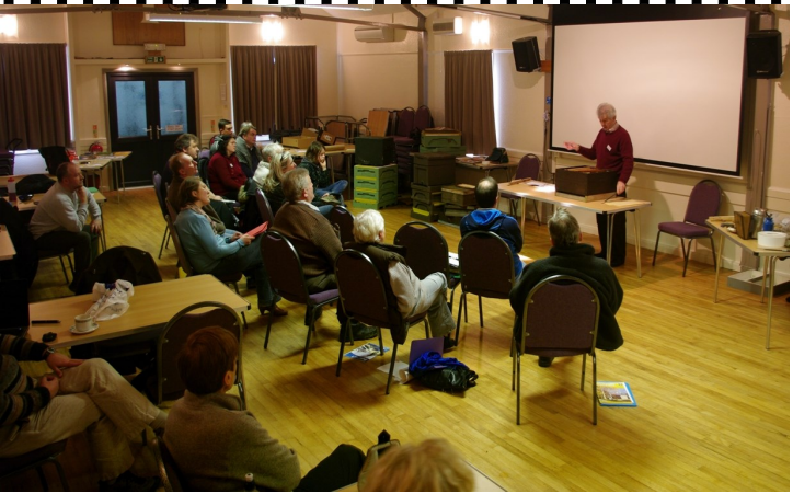
Participants at W&DBKA Beginners' Course on 8th March

The link to the document is: https://www.gov.uk/government/consultations/national-pollinator-strategy-for-bees-and-other-pollinators-in-england